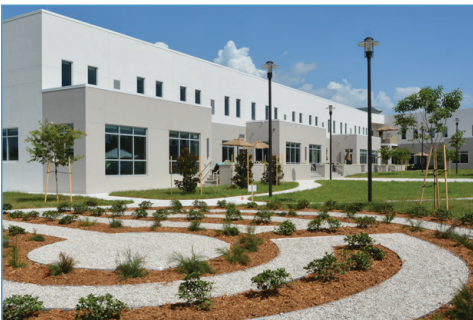
Grand Opening - July 2015

We couldn't have made it to this point without you. Thank you for investing in a safer future and saving lives of women, children and men escaping violent homes!