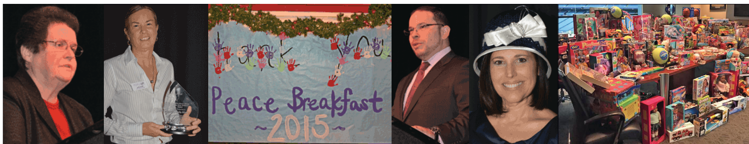
Signature Event: 2015 CASA Peace Breakfast