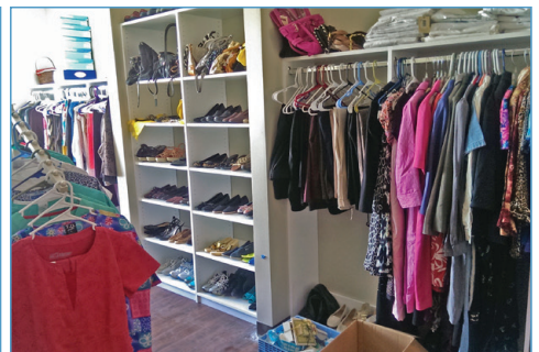
Emergency Clothing Boutique