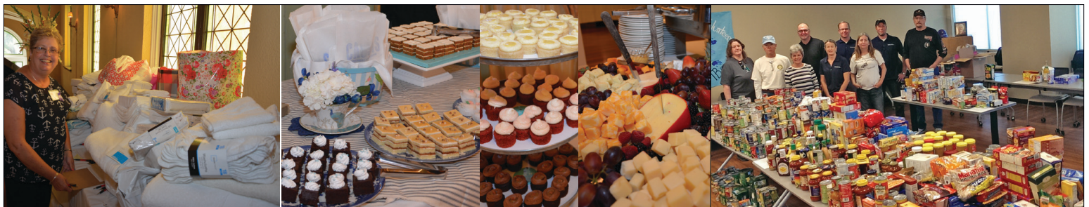
Signature Event: 2016 Good Night's Sleep Dessert Luncheon & Linen Drive

Community Education staff at events and meetings spread awareness and make CASA's resources known to survivors.